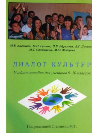
“Dialogue of Cultures” Curriculum program for higher secondary schools (RUS/ENG)